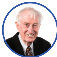
Prof Peter Doherty Doherty